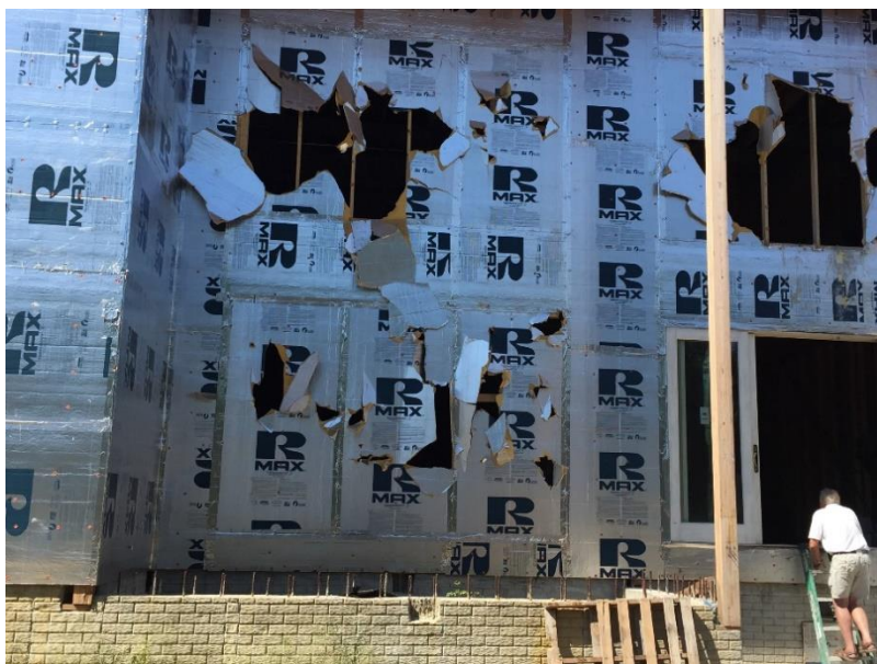
Damage to the construction

Today in spite of NO TRESPASSING signs at many locations on the island, picnickers and others continued their activities on the beach and on the interior areas of the island. Vandals became a particular problem this past summer. The damage caused by vandalism was dramatic and expensive to repair.