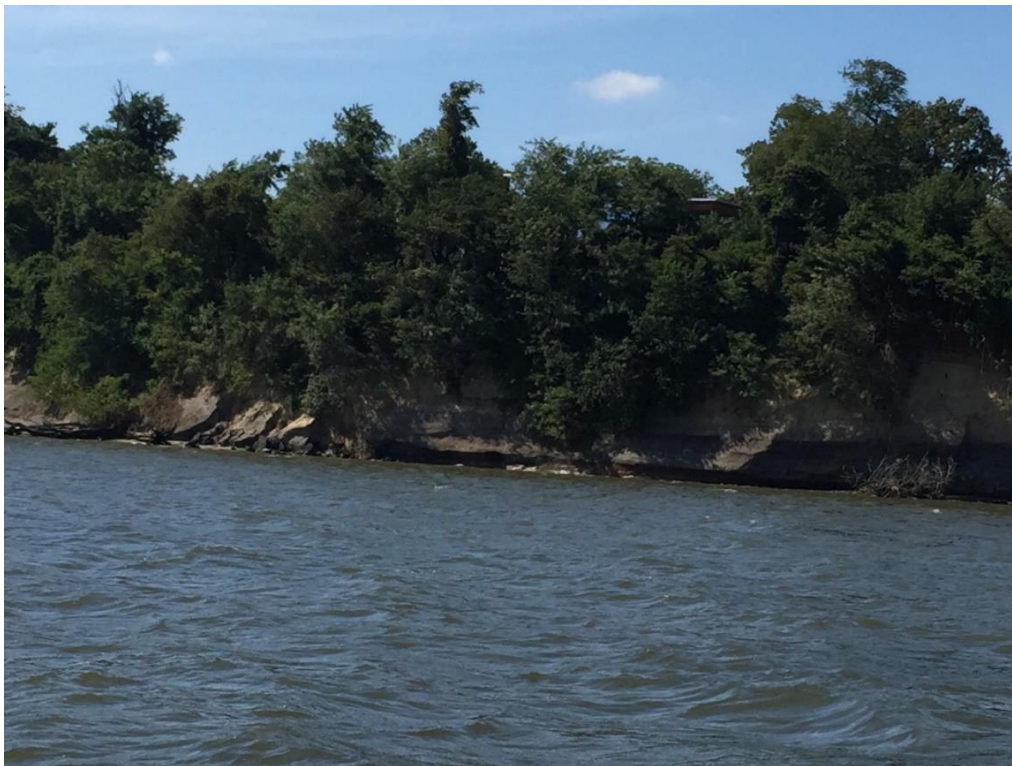
House from the south

Solutions for water (well) and electricity (solar & generator) have been resolved. (An underwater cable was not a consideration because of its cost!)