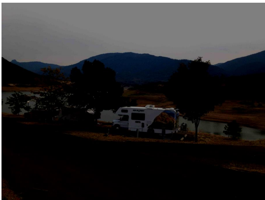
First campsite—Emigrant Lake County Park (the lake was at 27% of capacity!)