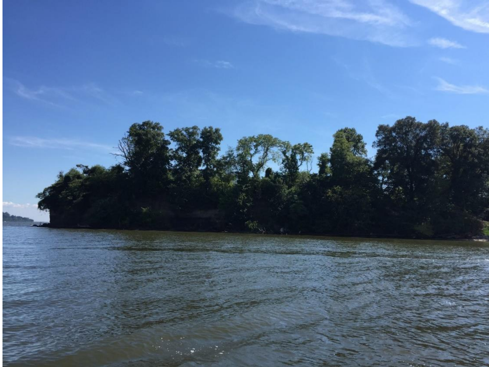
House from the north

In 2014 the Clickners finally obtained all the permits required to build their home. A pier and ramp were constructed on the north side (the beach side) to allow building materials and equipment to access the island.