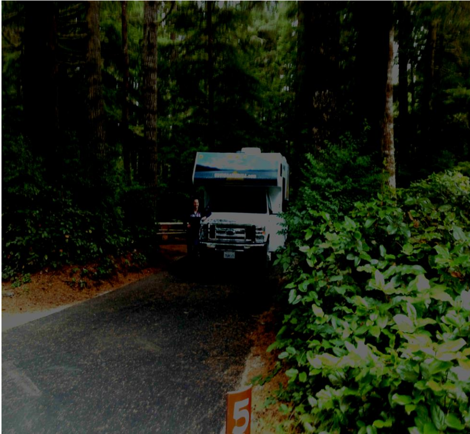
Second campsite—Umpqua Lighthouse State Park