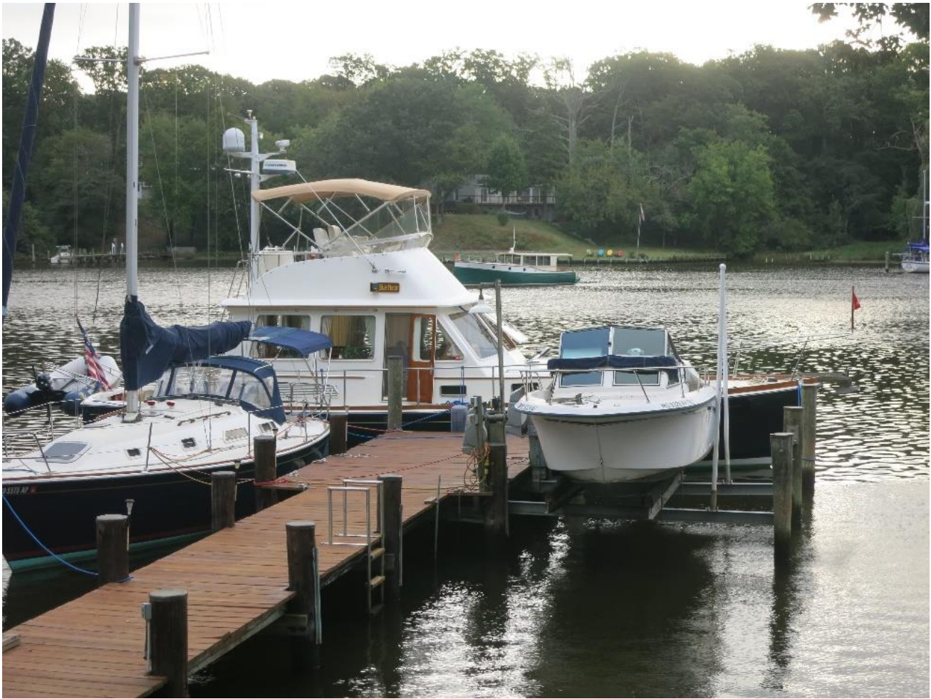
Blue Heron at the landing, with Griselda anchored in Cockey Creek Sunday Morning