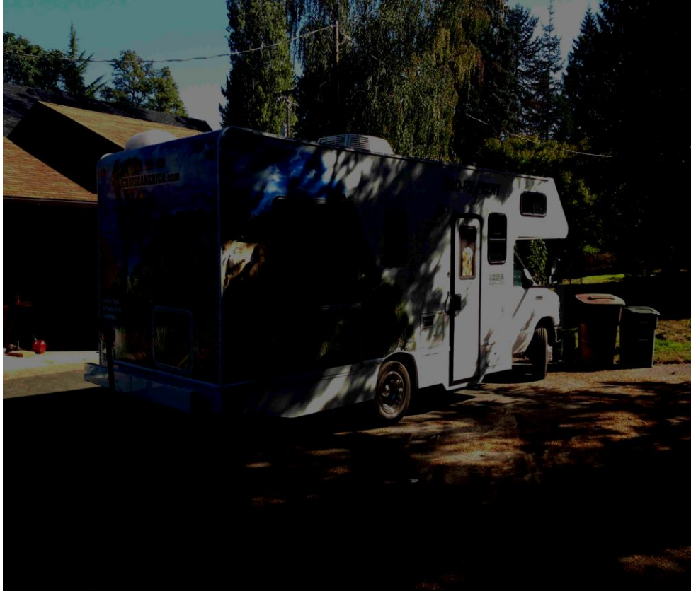
Starting out—my home for the next eleven days

Ashland (southwestern Oregon) and the Oregon Coast