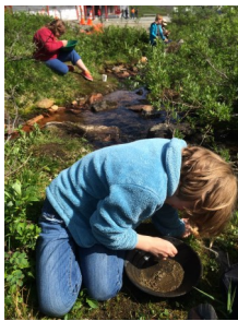
Panning for gold at the historic Independence Mine

Beyond this and such things as teachers and services, employment opportunities are primarily based in communities roughly 30-40 miles away.