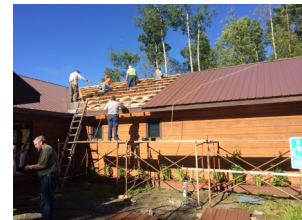
A VIM team from Tennessee work on the church roof.

weeks during the summer. Staying at the church or in member's homes, we experience first-hand what it is to be in ministry together