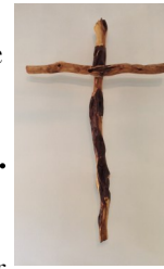
The cross at the front of the sanctuary is made from diamond willow

Willow UMC is near the center of the area that makes up Willow. We are the only mainline Protestant church for over 30 miles, and one of the largest churches in Willow. With about 50-60 in worship each Sunday, we are a larger family-like church. Much of our focus is on responding to the poverty we see around us.