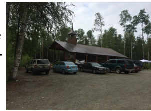
The Willow Church and Community Food Pantry

between 200-300 people monthly. We have a firewood ministry, help with specific construction projects on homes as needed, and have a fuel voucher program. The Church and Community Ministry also partners with the Willow Health Organization and the Willow Area Community Organization (WACO) in improving services and events available to the community.