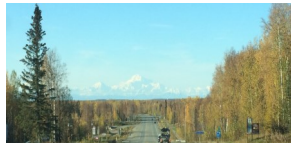
A View of Denali from Willow

who want to get out of the city for the 'real Alaska' experience. Anything from simple small cabins to extensive second homes are spaced throughout the