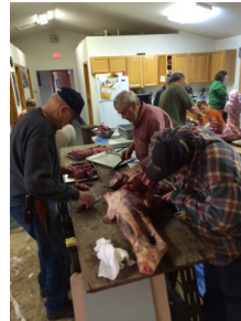
Volunteers from the church butcher a moose that was donated to the Food Pantry.

Our Mission Statement is: To be a mission outpost of the United Methodist Church in Alaska, and as Christ's disciples responding to God's love by our witness, stewardship and outreach with and for all persons and creation.