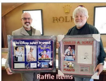
Walt Disney's 'Mary Poppins' autographed by Julie Andrews & Dick Van Dyke