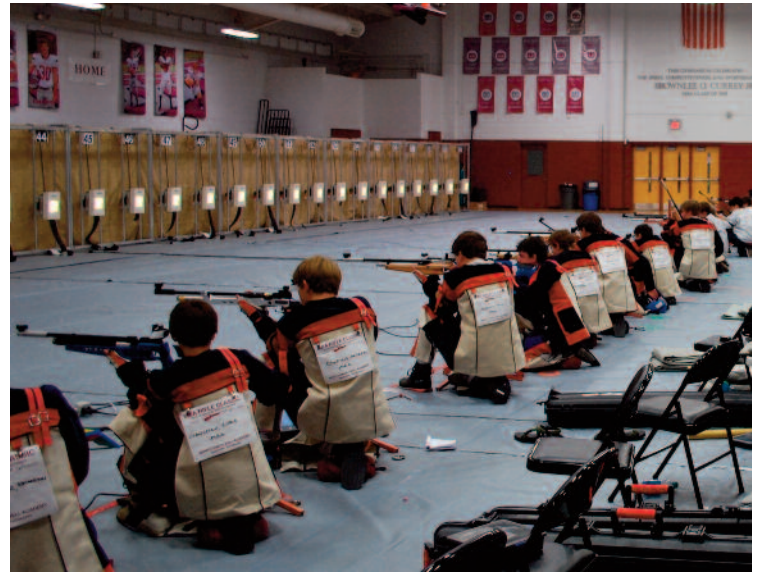
For the Classic, two basketball gyms are converted into a state of the art 60 point MegaLink electronic range.

Position Rifle Clinics: The Army Marksmanship Unit from Fort Benning, GA will conduct the following rifle clinics during the Rifle Classic weekend: