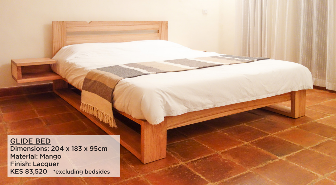
GLIDE BED Dimensions: 204 x 183 x 95cm Material: Mango Finish: Lacquer KES 83,520 *excluding bedside