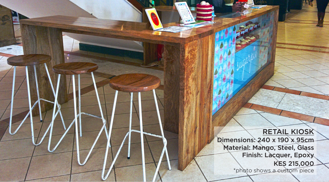
RETAIL KIOSK Dimensions: 240 x 190 x 95cm Material: Mango, Steel, Glass Finish: Lacquer, Epoxy KES 215,000 *photo shows a custom piece