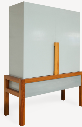
REPUBLIC CABINET Dimensions: 138 x 57 x 182cm Material: Mvuli, MDF Finish: Lacquer, Paint KES 67,280