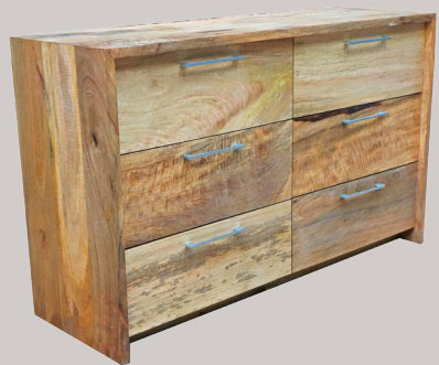
CASCADE DRESSER Dimensions: 150 x 50 x 92cm Material: Mango, Steel Finish: Lacquer KES 64,960