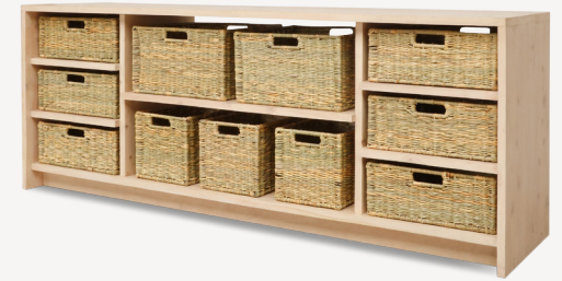
BASKET STORAGE UNIT Dimensions: 240 x 60 x 91.5cm Material: Cypress, Papyrus Finish: Pinotex KES 64,960