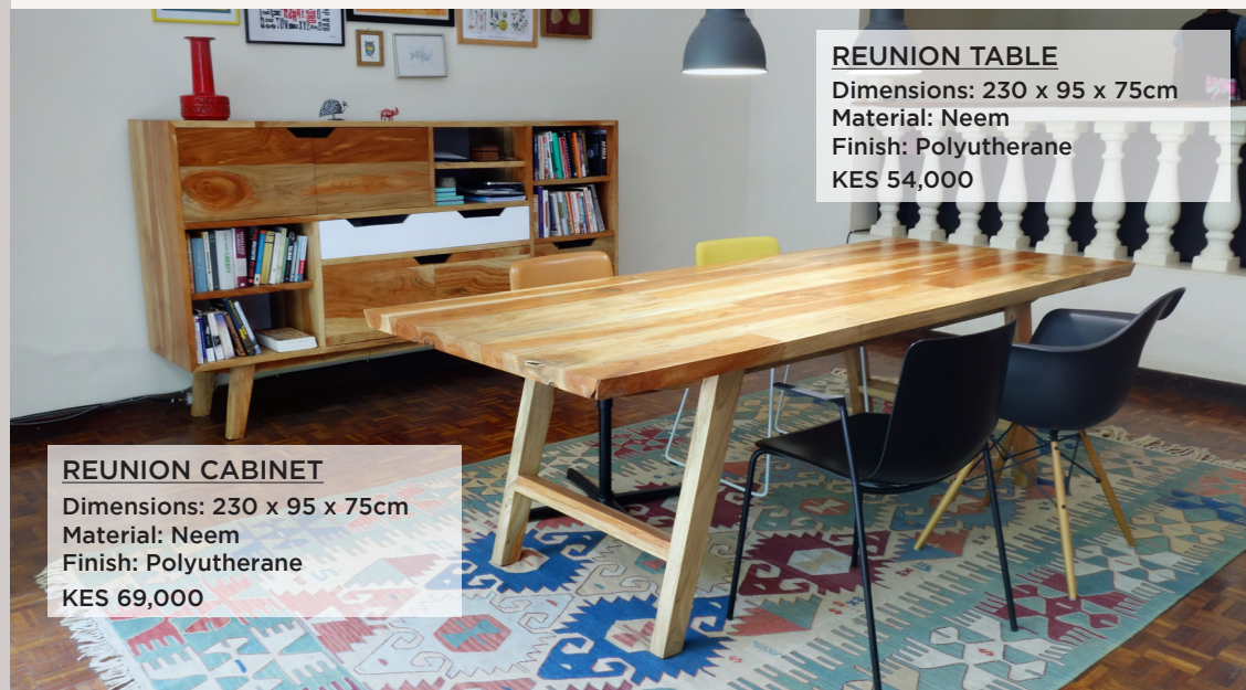
REUNION TABLE Dimensions: 230 x 95 x 75cm Material: Neem Finish: Polyutherane KES 54,000