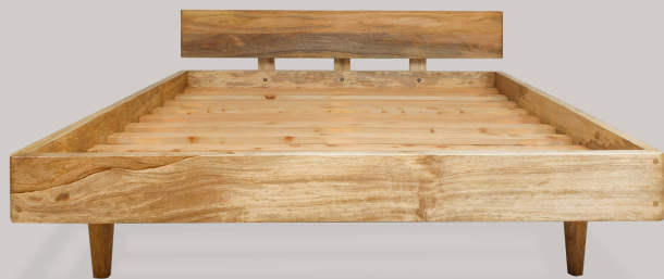
BASIS BED Dimensions: 208 x 195 x 83cm Material: Mango Finish: Lacquer KES 67,280