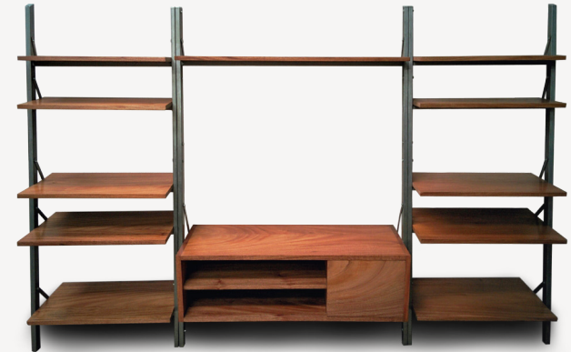
LADDER UNIT Dimensions: 285 x 45 x 180cm Material: Mahogany, Steel Finish: Outdoor varnish KES 90,480