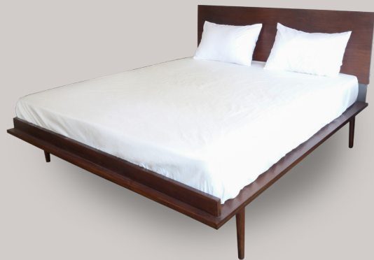
RISE BED Dimensions: 220 x 193 x 108cm Material: Mvuli Finish: Lacquer KES 71,920