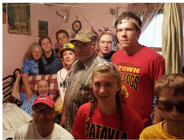
An ASP family & Batavia ASP work crew