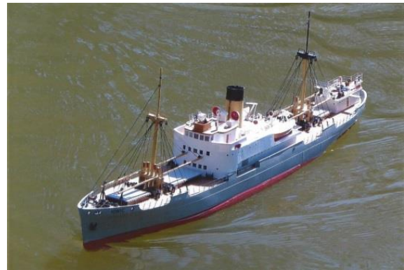
“Ionic” – Fully Refrigerated 1960's Cargo Ship

Moulded GRP. hull, timber deck and superstructure.