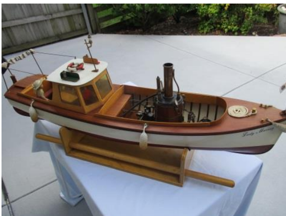
“Lady Murray” - English Lake Steam Launch

GRP hull with timber deck and superstructure. Lights and nozzle steering.