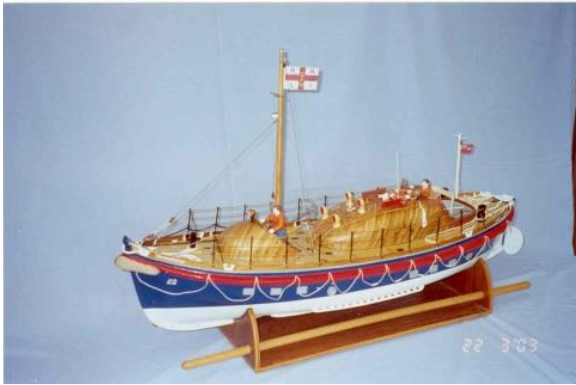
“Trowbridge” - R.N.L.I. English Lifeboat.

Moulded GRP hull with timber deck and superstructure. Twin electric motors driving twin props in tunnels.