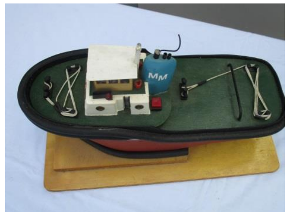
“Whoops” - Small Tug

ABS Hull, deck and superstructure. Twin Voith Schnieder electric propulsion units. Fitted with two water pumps operating three fire monitors, revolving radar scanner, lights and sound.