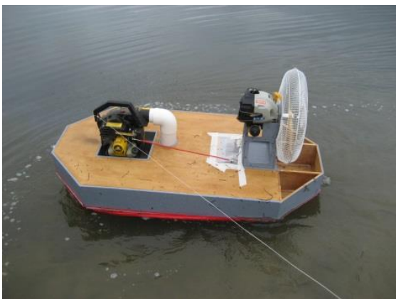
“Uncontrollable” – Hovercraft

ABS. hull, plywood deck and plasticard superstructure. Electric motor.