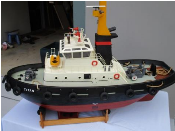
“Titan” - Tractor Tug

Balsa and plywood, plastic helicopter, electric motor.