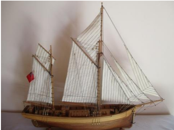
“Clara May” - English Coastal Ketch