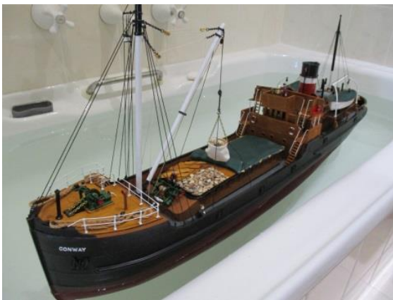
“Conway” - 1916 English Collier

Moulded GRP. hull, timber deck and superstructure.