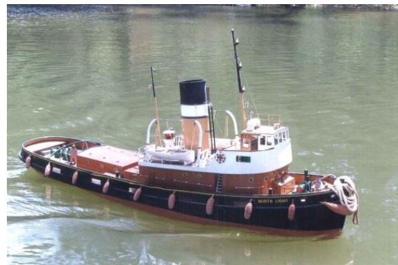
“North Light” - 1960 River Mersey Steam Tug

Plywood hull with reinforced nylon skirt. Blower/Vac motor used for lift, Whipper shipper motor with laminated timber prop for thrust. Aluminium motor mounts and twin rudders.