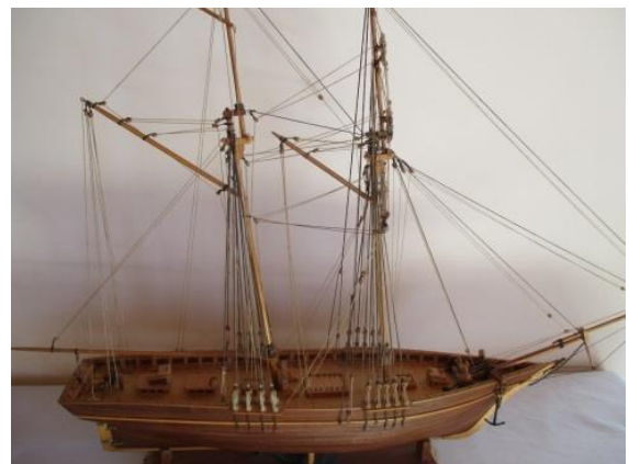
“Scottish Maid” - Two Masted Schooner

ABS Hull with laid timber deck and superstructure. Twin cylinder double acting steam engine, boiler with auto gas control and whistle. Lights.