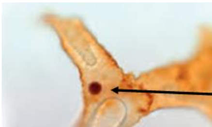
T. Rex red blood cell

In the months and years to follow Dr. Schweitzer has ruled out nearly all the objections. She has discovered not only intact dinosaur tissue but even red blood cells in their intact blood vessels.