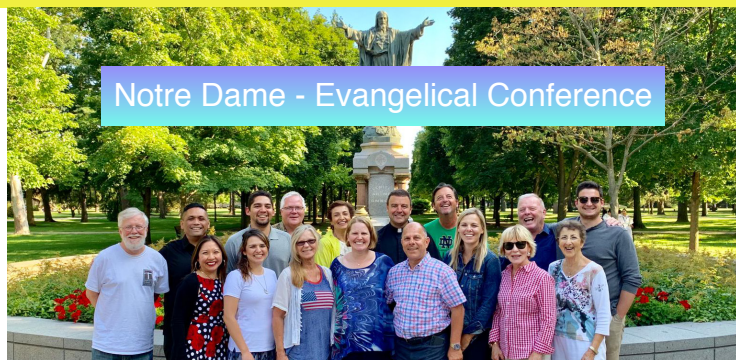
Notre Dame - Evangelical Conference