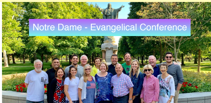
Notre Dame - Evangelical Conference