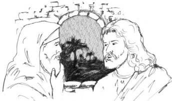
Jesus Teaches Nicodemus