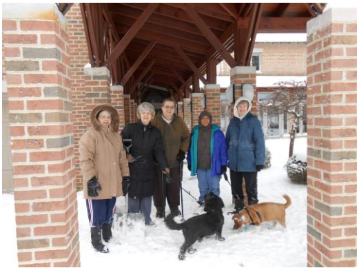
community 'snow day'

February has continued to bring us the Siberian experience except this time the ice is playing havoc with our ambulatory roof. If you walk down the ambulatory you will find, "water, water everywhere and not a drop you'd dare to drink." We have been using drop sheets and the water vacuum to clean it all up. Once the ice melts it will be fine. We, however, are grateful we have had nothing compared to what our sisters and brothers have suffered in the South and in the East. We pray for them every day.