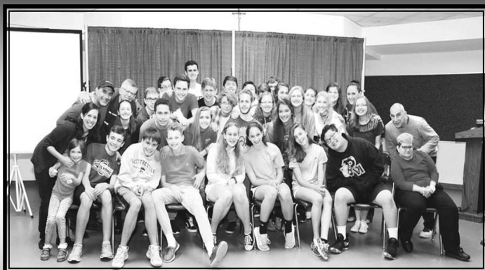
Blessing the Seniors and welcoming rising Freshman! See you in the Fall!

Registration forms 2018-2019 available in the Parish and Religious Education Offices