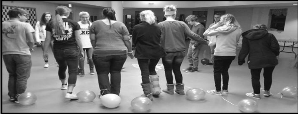
High School: Saturday Evenings! Dinner! Youth Group!