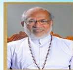
Major Arch Bishop George Card. Alencherry