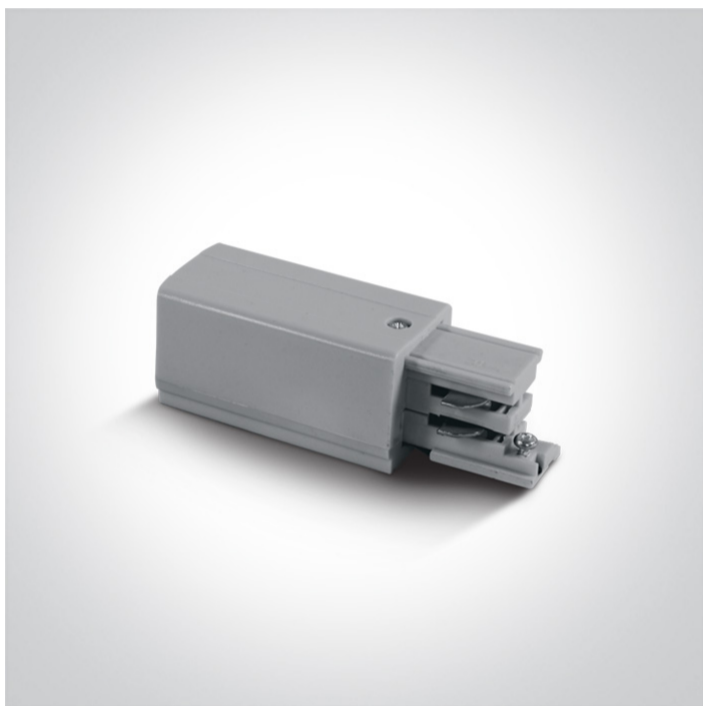
16A Grey Live End Left for track 40003A.