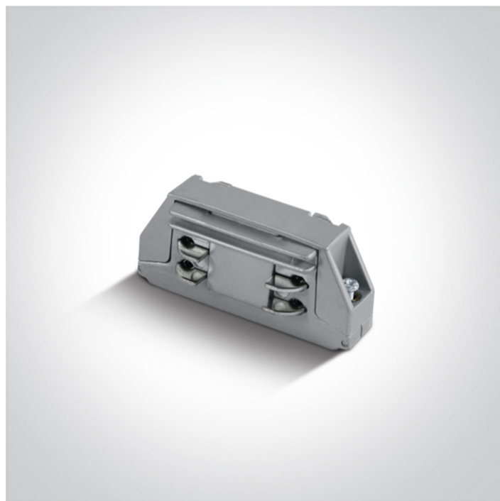
16A Grey connector for track 40003A.