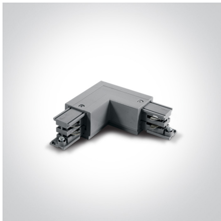
16A Grey Corner Left for track 40003A.