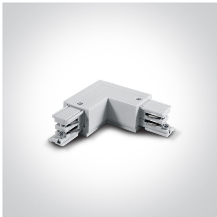
16A White Corner Left for track 40003A.