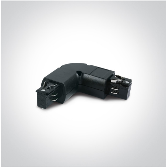
16A Black Corner Right for track 40003.