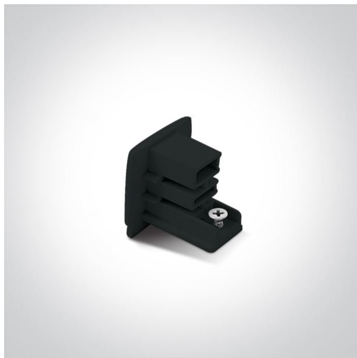
Black End cup for 40003A.