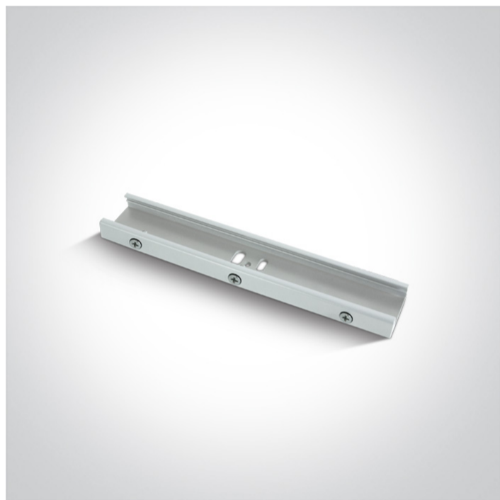
White Connector for suspending 40003A Track