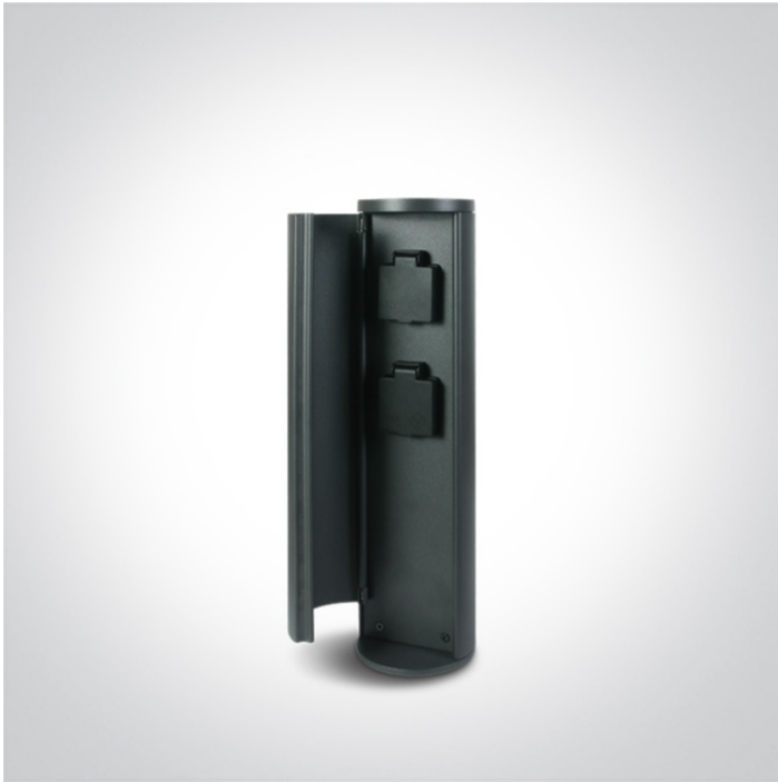
Bollard with 2x1000W Schuko Sockets , IP44.