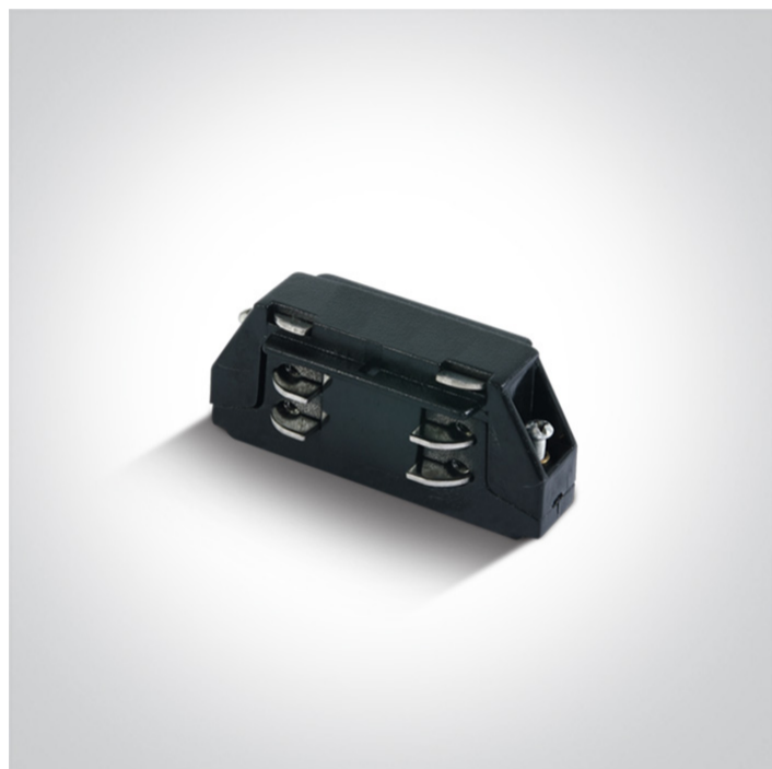
16A Black connector for track 40003A.