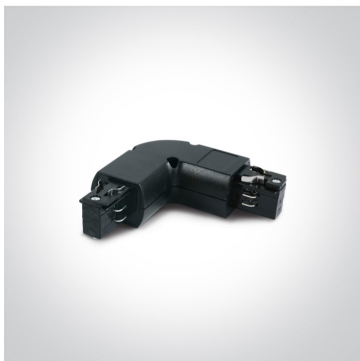
16A Black Corner Left for track 40003.