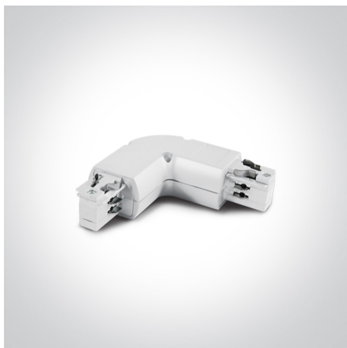
16A White Corner Left for track 40003.