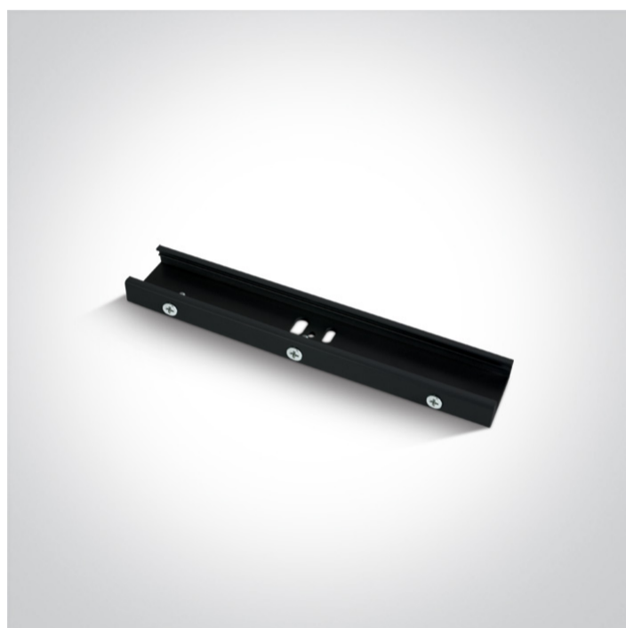
Black Connector for suspending 40003A Track