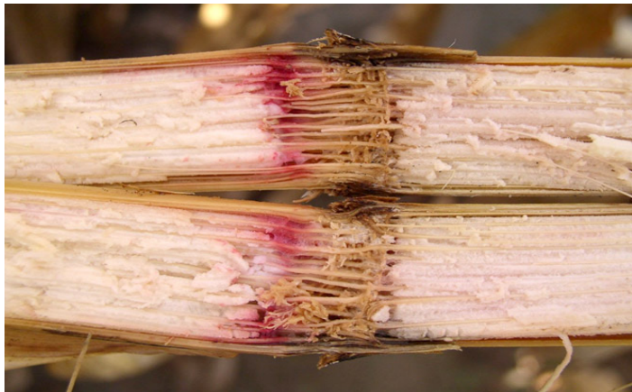
Figure 4. Pink to reddish discoloration characteristic of Gibberella.