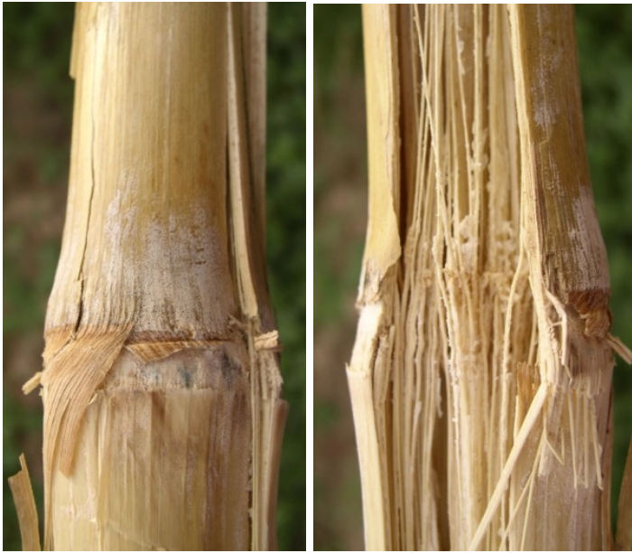
Figure 7. External and internal fusarium stalk rot symptoms.