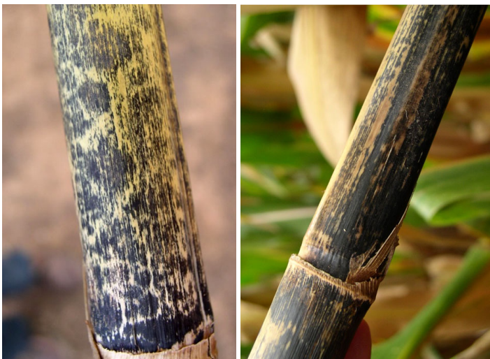
Figure 1. External stalk discoloration caused by anthracnose.