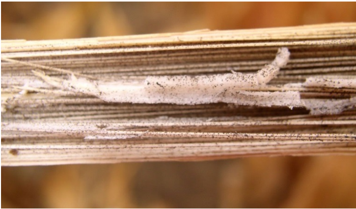
Figure 11. The very tiny black sclerotia on the vascular strands of the shredded pith are a characteristic sign of charcoal rot.