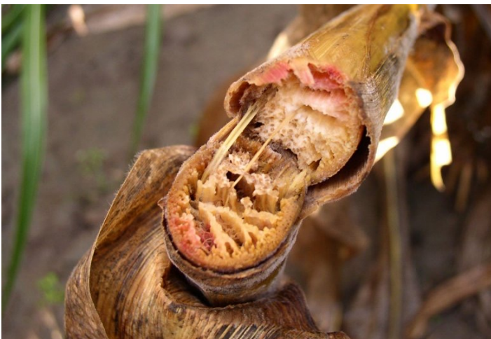
Figure 5. Stalk breakage at the node caused by Gibberella.