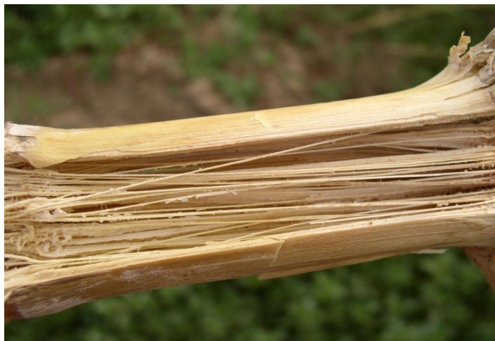
Figure 6. Disintegrated stalk pith caused by Fusarium.