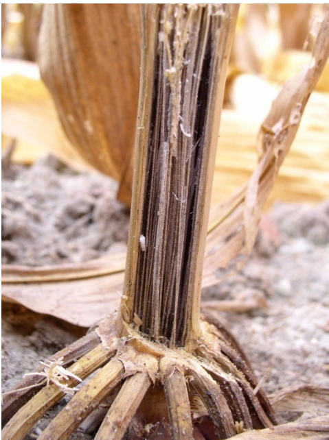
Figure 12. Charcoal rot begins as a root infection, which spreads into the lower stalk internodes and causes early ripening, shredding and breaking at the crown of the corn stalk. Charcoal rot is favored by heat and drought stress.