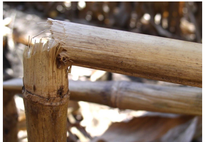
Figure 10. Broken corn stalks due to Diplodia stalk rot infection.