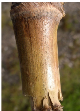
Figure 8. Diplodia stalk rot.