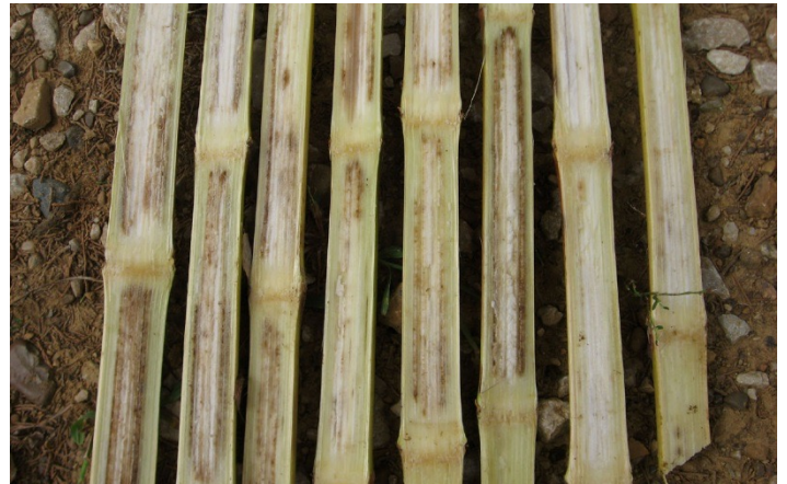
Figure 2. Internal stalk symptoms of anthracnose.