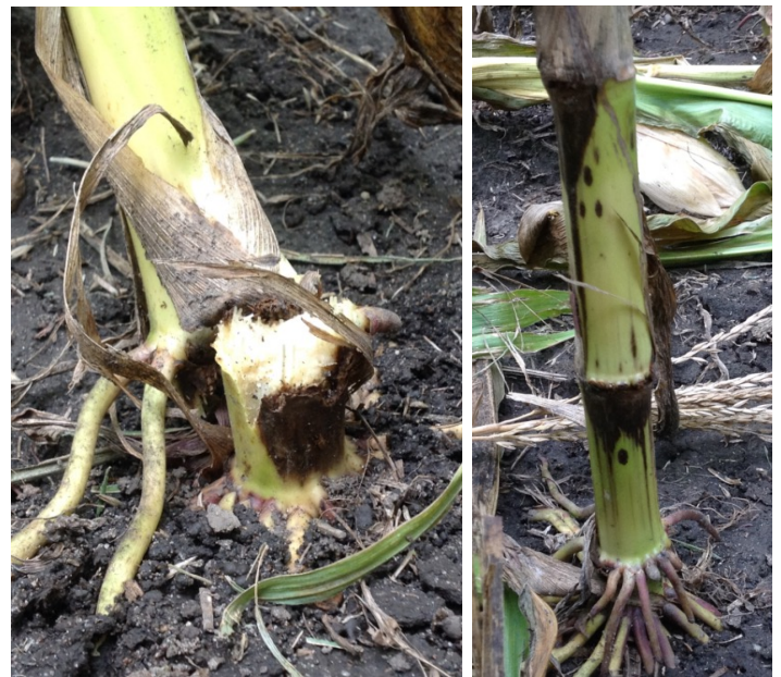
Figure 13. Stalk breakage and dark lesions on lower nodes of plants affected by Physoderma stalk rot.