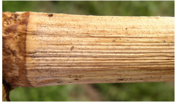
Figure 9. Corn stalk showing Diplodia stalk rot symptoms. Note pycnidia on corn stalk node.