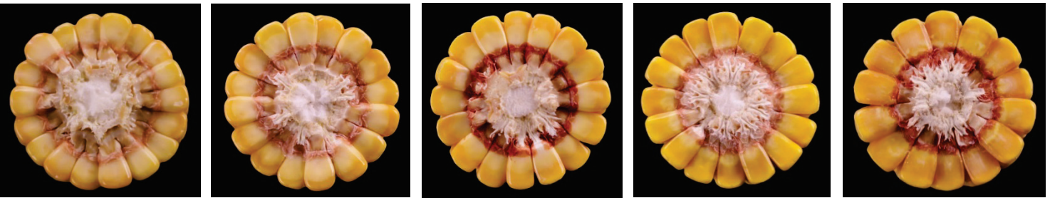
Figure 5. Estimated yield loss associated with termination of grain fill prior to physiological maturity.

Grain Moisture: 30-35% 0 GDUs remaining to maturity Yield loss at this stage: 0%