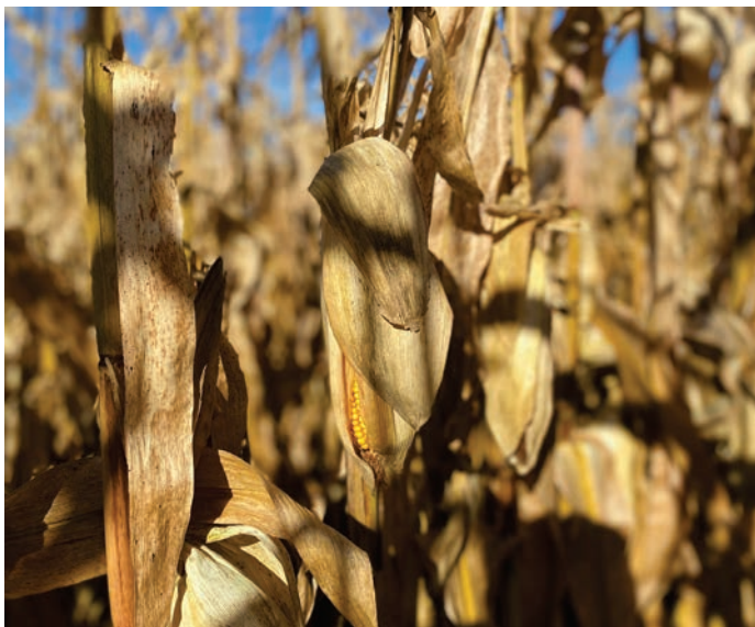
Figure 1. It is common for mature ears to tip downward prior to harvest.