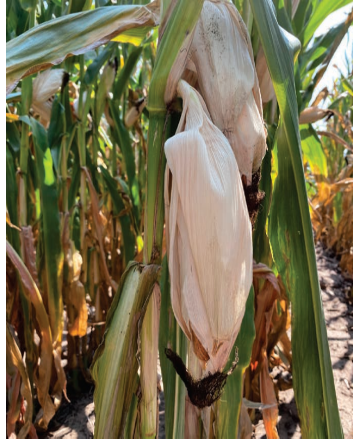
Figure 6. Severe late-season stress can weaken stalks and ear shanks as the plants remobilize carbohydrates to fill the ear.