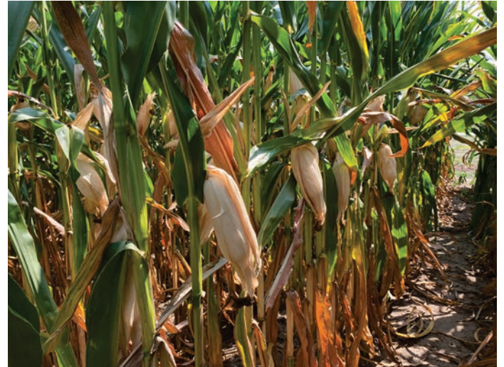
Figure 2. Drooping ears on plants that experienced severe late-season heat and drought stress. Ears on these plants were at around 50% milk line, meaning that around 12-15% of yield would be lost if grain fill ended at this point. Corteva Agriscience Johnston Field Research Center, Johnston, IA. August 30, 2023.