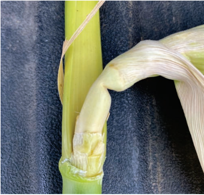
Figure 4. Close-up of a pinched ear shank on a plant that experienced severe late-season drought resulting in ear declination prior to physiological maturity. The pinched shank restricts the flow of sugars into the developing ear. Johnston, IA. August 30, 2023.