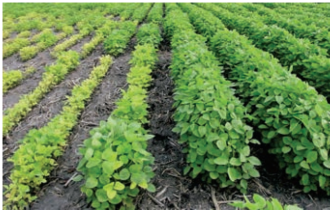
Figure 3. Pioneer soybean variety trial showing differences in IDC symptoms between a more susceptible variety (left) and a more tolerant variety (right).

Additionally, Pioneer agronomists routinely establish observation plots of soybean varieties in soils prone to IDC. Symptoms are assessed throughout the growing season to help further understand variety tolerance to IDC and optimize IDC management at the local level.