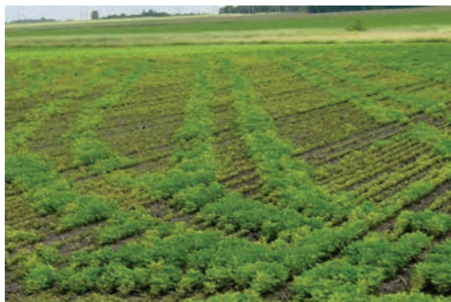
Figure 2. A field with reduced IDC symptoms in areas where soil was compacted by wheel traffic.

The fact that lower oxygen levels in the soil can both reduce IDC severity due to a reduction in nitrates in the soil and increase IDC severity in saturated soils by limiting iron uptake exemplifies the complexity of factors and interactions that contribute to IDC occurrence.