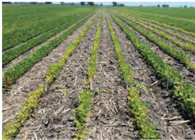
Figure 6. Corteva Agriscience single-row observation plots showing varietal differences in tolerance to IDC.

Genetic prediction models give soybean breeders the ability to predict the probable IDC tolerance of a soybean line and leverage that information in variety selection prior to any in-field testing. Observations captured from multiple soybean lines over multiple years and locations, coupled with molecular marker and genotypic data, are used to create these models. Soybean lines predicted to have high levels of IDC tolerance can be selected and advanced into field screening trials for further characterization.