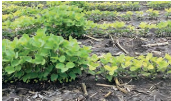
Figure 4. Soybeans showing differences in IDC symptoms at different plant densities. Soybeans on the left were planted at 200,000 seeds/acre and those on the right were planted at 140,000 seeds/acre.

soil and reduced root growth and health. The reduction in root health and the lower solubility of iron in wet soils are major contributors to IDC symptoms. Practices that improve soil structure and water infiltration can reduce issues with IDC. Field tile drainage is also important to consider where applicable to help with soil moisture levels.