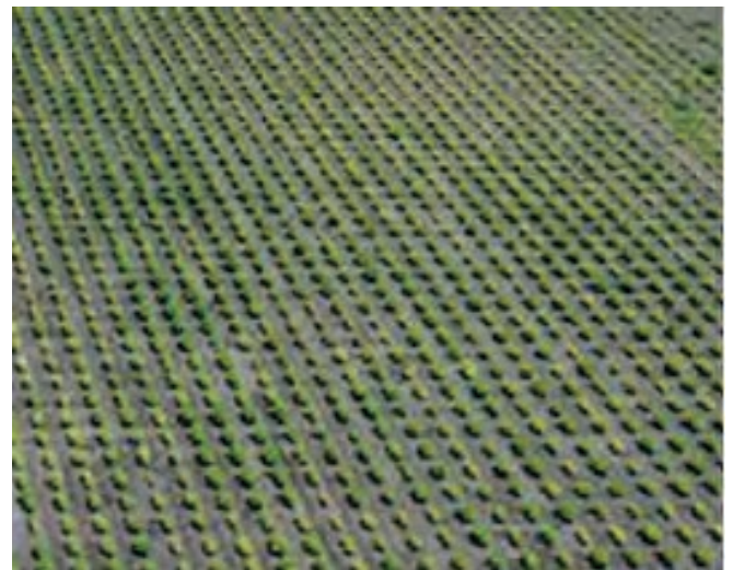
Figure 7. Aerial view of a Corteva Agriscience soybean IDC field screening nursery.

Field trials for tolerance are conducted at managed screening nurseries located from the Red River Valley of Northwest Minnesota through Central Minnesota and North Central Iowa to Eastern Nebraska. Multiple replications of each genotype are planted in fields identified as having uniform characteristics conducive for IDC manifestation and a history of IDC sensitive observations. Each plot is scored on a scale of 1 through 9, with 1 being the most sensitive to IDC and 9 being the most tolerant. Field screening nurseries often include thousands of plots (Figure 7).