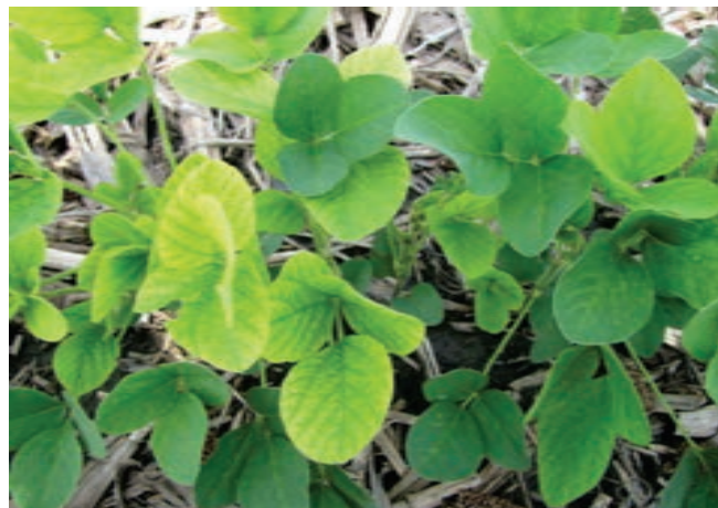
Figure 1. Interveinal chlorosis pattern characteristic of iron chlorosis of soybeans.

Symptoms will not be visible until soybeans begin to develop trifoliate leaves. Cotyledons and unifoliate leaves do not exhibit IDC symptomology. Symptoms may increase or decrease in intensity during the season depending on growing