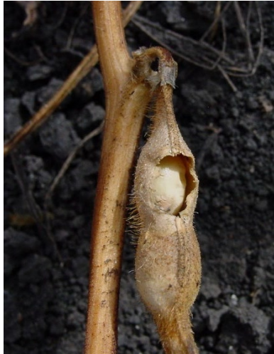
Figure 2. Soybean pod damaged by bean leaf beetles and/or grasshoppers.