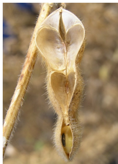
Figure 1. A soybean pod that has been split open as a result of hail damage at the R7 growth stage (beginning maturity).