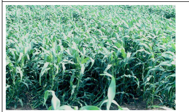
Figure 2. Same plot as above three days after simulated wind lodging.