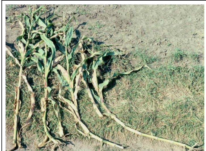
Figure 3. Left to right, control (no lodging) and plants with simulated wind lodging at V10, V12, and V16 stages. Lodging occurred in July, photos were taken in early September.