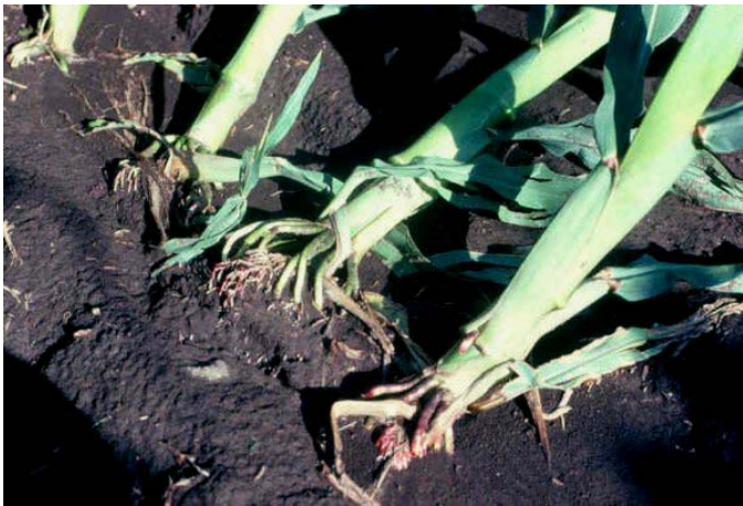
Some plants are partially uprooted when wind-lodging occurs.