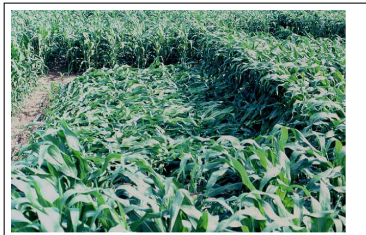
Figure 1. Research plot immediately after artificially induced "wind lodging" at the V12 growth stage.

Also, losses with combine harvest could be greater than the hand-harvested yields shown in Table 1. Following lodging, plants straightened to the extent that ears were at least 18 in. above the soil surface at harvest (Table 1 and Figures 3 and 4).