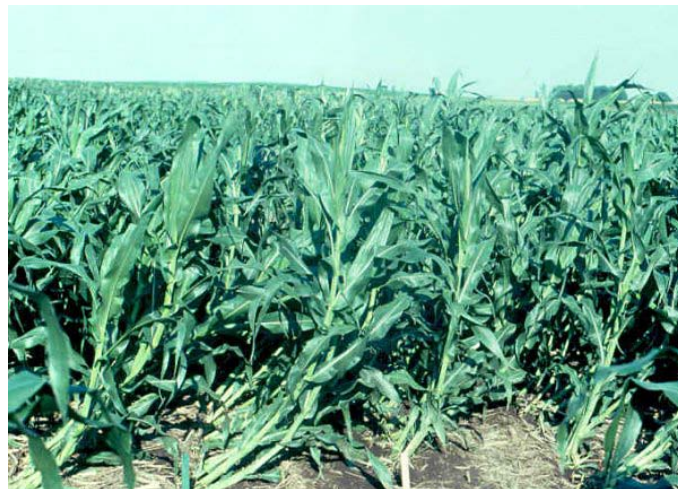
“Goose-necked” corn plants following an early July storm.

Wind lodging usually occurs when soils are saturated by heavy rain and the rain occurs with high winds. These conditions soften the soil while simultaneously applying lateral forces on the plant. Wind lodging is not always related to root injury.