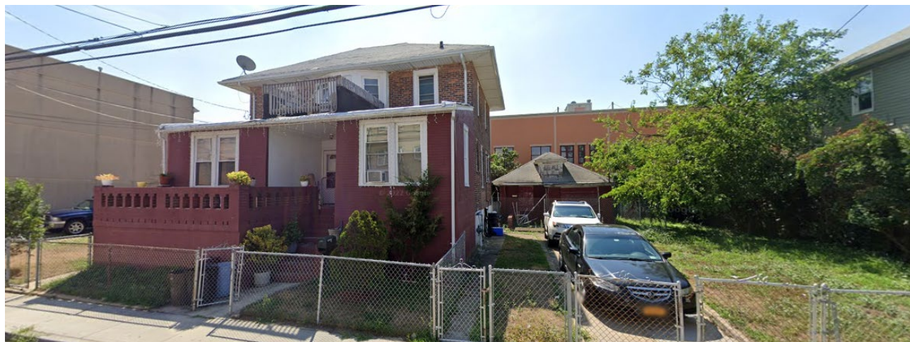
1-83A Beach 27 th Street