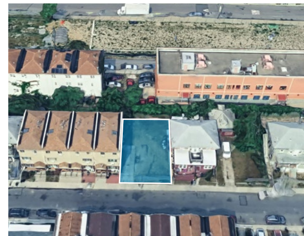
Beach 27 th Street

Exclusively Represented By 212.544.9500 | arielpa.nyc