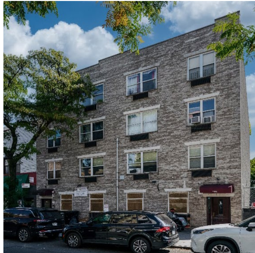
2376 Hoffman Street

Exclusively Represented By 212.544.9500 | arielpa.nyc