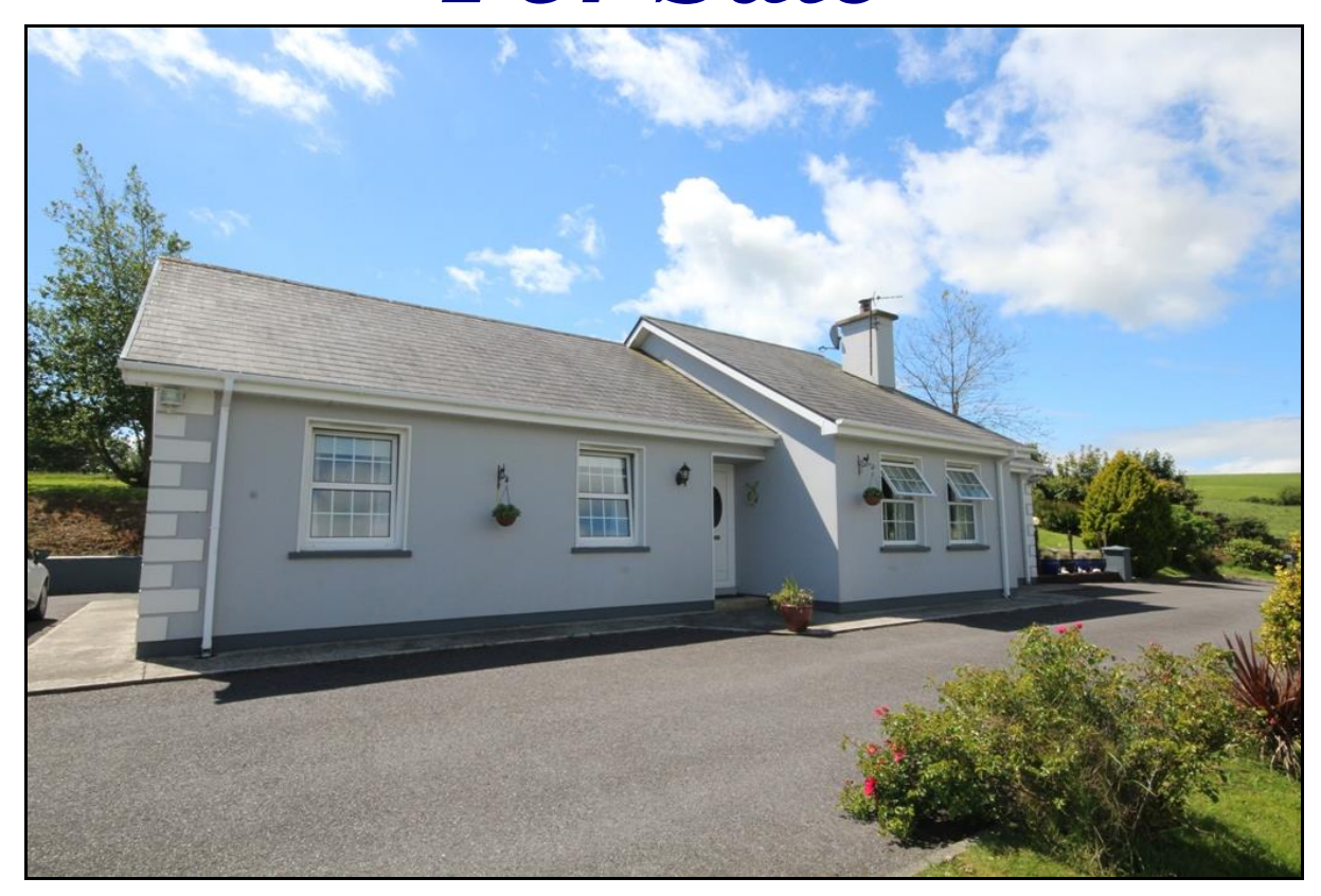
"Amberley", Baurleigh, Bandon, Co Cork. P72Y394 4 bed bungalow on circa .88 acre

Paddy Murray Auctioneers are delighted to bring to the market this splendid and exceptionally spacious four bedroomed bungalow superbly positioned half way between Bandon and Kilbrittain. Located just off the main road, this beautifully finished and well laid out property is the perfect purchase for any family looking to settle in their dream home. The space on offer is exceptional, both inside and out while the privacy here is unrivalled. Combining the perfect balance for day to day modern living this tastefully finished home will tick a lot of the right boxes for any discerning buyer. All this is approached via a gated driveway and the property sits on approx. 0.88 acres of well maintained gardens and grounds. All in all, a home well worth viewing!