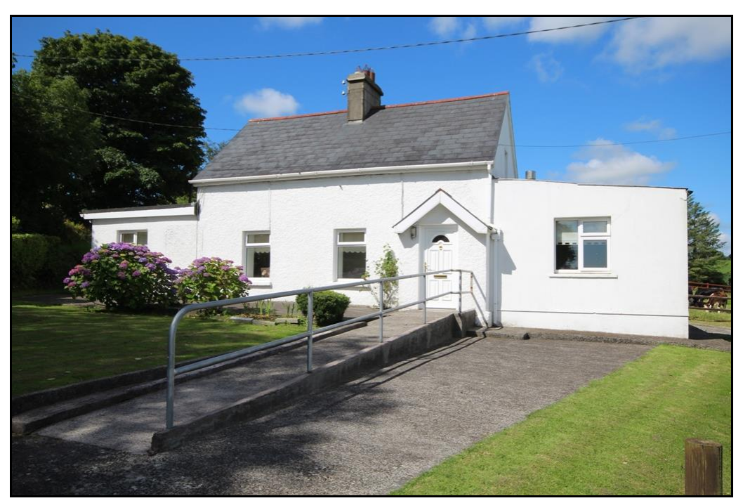
Knocknagallagh, Bandon, Co Cork. P72 AW65