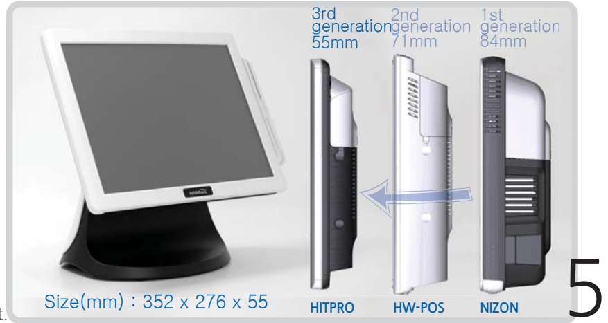
5 · HITPRO is applied of HANASIS' state-of-the-art skills.