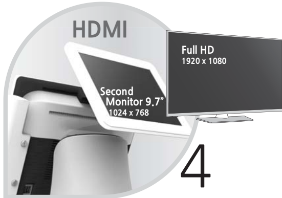
4 · Second Monitor (9.7", optional) · Full HD(1920x1080) Monitor(TV) connection support.