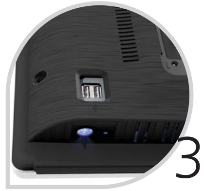
3 · Easy USB connection