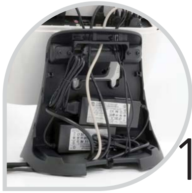
1 · Spacious Stand storage space.

HITPRO support Intel® processor and Microsoft® Windows 10, HITPRO can adopt various options.