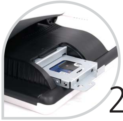
2 · Easy disassembly for A/S process