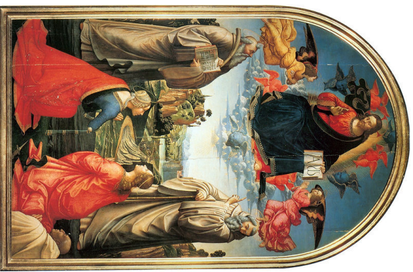
Domenico Ghirlandaio, Christ in Heaven with Four Saints and a Donor, 1492 (Pinacoteca Comunale, Volterra)

But he, filled with the holy Spirit, looked up intently to heaven and saw the glory of God and Jesus standing at the right hand of God, and he said, "Behold, I see the heavens opened and the Son of Man standing at the right hand of God." But they cried out in a loud voice, covered their ears, and rushed upon him together. They threw him out of the city, and began to stone him. The witnesses laid down their cloaks at the feet of a young man named Saul. As they were stoning Stephen, he called out, "Lord Jesus, receive my spirit." Then he fell to his knees and cried out in a loud voice, "Lord, do not hold this sin against them"; and when he said this, he fell asleep.