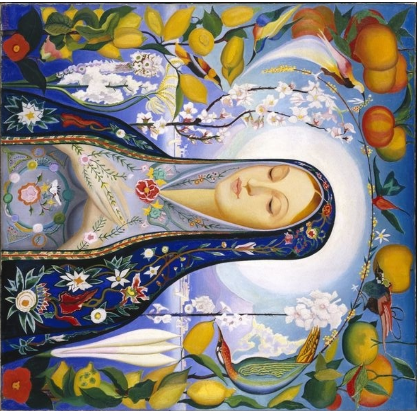
Joseph Stella, Holy Mary Mother of God, 1926 (Brooklyn Museum)

And Mary kept all these things, reflecting on them in her heart.