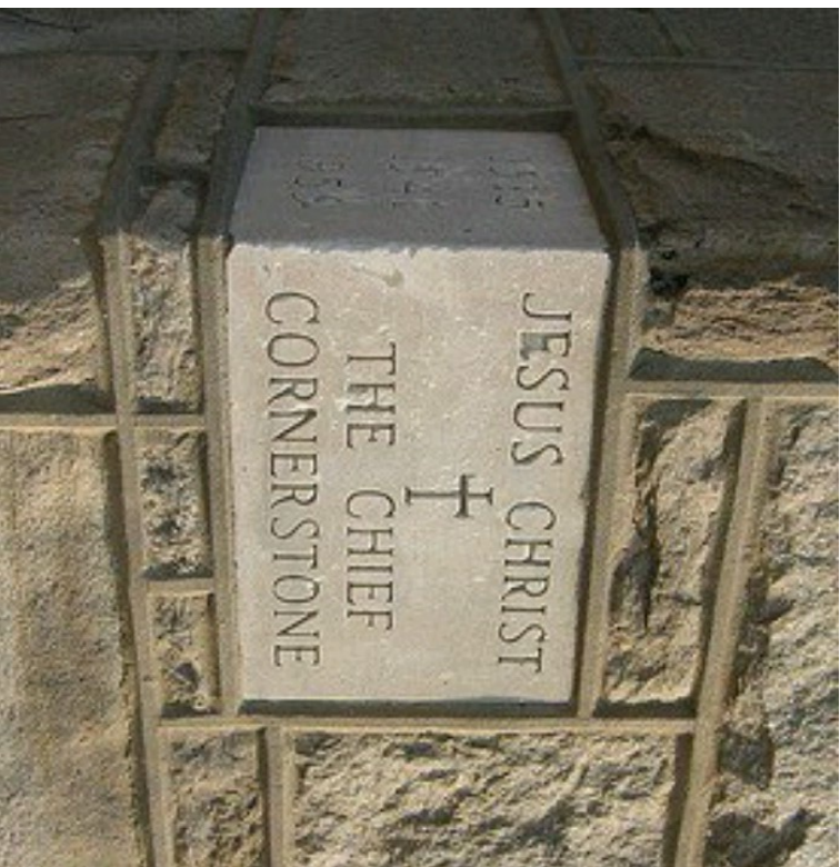
The Chief Cornerstone

Then all of you and all the people of Israel should know that it was in the name of Jesus Christ the Nazorean whom you crucified, whom God raised from the dead; in his name this man stands before you healed. He is 'the stone rejected by you, the builders, which has become the cornerstone.'