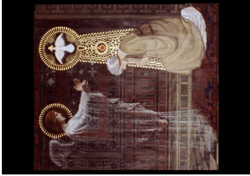
Annunciation (ORATORIO DELLA SS. TRINITÀ NEL PALAZZO VESCOVILE)

And the angel said to her in reply, "The holy Spirit will come upon you, and the power of the Most High will overshadow you. Therefore the child to be born will be called holy, the Son of God.