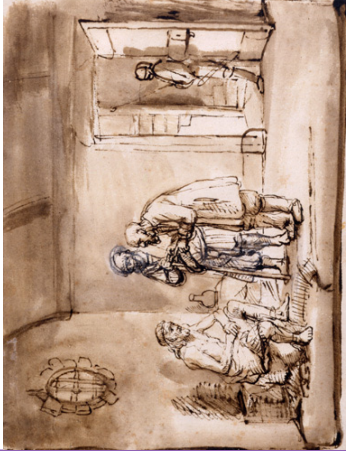
Samuel van Hoogstraten, St. John the Baptist in Prison receives Christ's answer, 1627-1678

Of the works of the Messiah, he sent his disciples to him with this question, "Are you the one who is to come, or should we look for another?" Jesus said to them in reply, "Go and tell John what you hear and see: the blind regain their sight, the lame walk, lepers are cleansed, the deaf hear, the dead are raised, and the poor have the good news proclaimed to them. And blessed is the one who takes no offense at me."