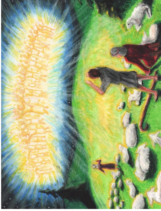
Amber Pine, Glory to God in the Highest

Now there were shepherds in that region living in the fields and keeping the night watch over their flock. The angel of the Lord appeared to them and the glory of the Lord shone around them, and they were struck with great fear. The angel said to them, "Do not be afraid; for behold, I proclaim to you good news of great joy that will be for all the people. For today in the city of David a savior has been born for you who is Messiah and Lord. And this will be a sign for you: you will find an infant wrapped in swaddling clothes and lying in a manger." And suddenly there was a multitude of the heavenly host with the angel, praising God and saying: "Glory to God in the highest and on earth peace to those on whom his favor rests".