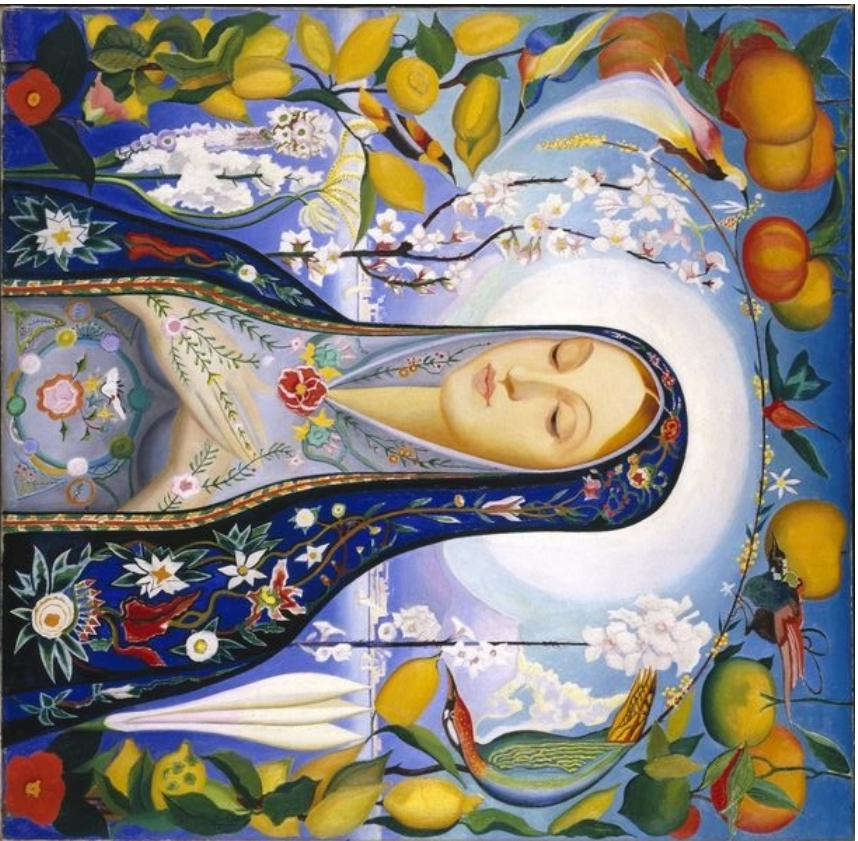
Joseph Stella, Holy Mary Mother of God, 1926 (Brooklyn Museum)

And Mary kept all these things, reflecting on them in her heart.