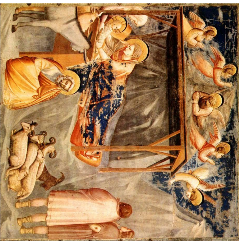
Giotto, Nativity, 1305 (Scrovegni Chapel)

But a shoot shall sprout from the stump of Jesse, and from his roots a bud shall blossom. The spirit of the LORD shall rest upon him: a spirit of wisdom and of understanding, A spirit of counsel and of strength, a spirit of knowledge and of fear of the LORD.