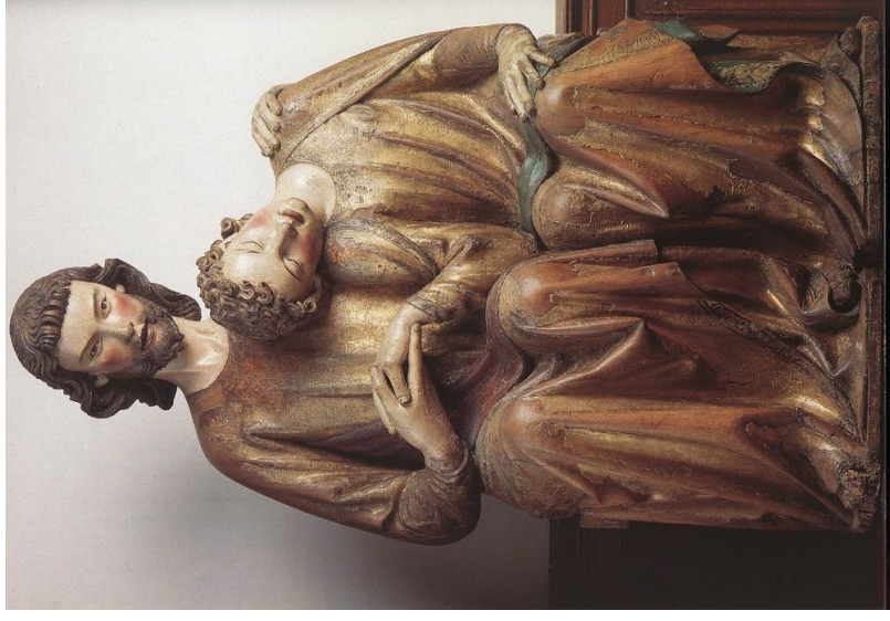
Master Heinrich of Konstanz, St John Resting on Jesus' Chest, c. 1320 (Museum Mayer van den Bergh, Antwerp)

Peter turned and saw the disciple following whom Jesus loved, the one who had also reclined upon his chest during the supper and had said, "Master, who is the one who will betray you?":