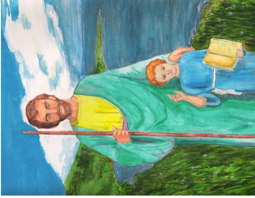
pinkvynliangel, St. Joseph + Jesus

The child grew and became strong, filled with wisdom, and the favor of God was upon him.