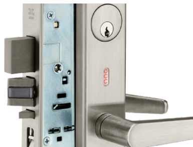
Red indicator available on mortise locks (Classroom Security Intruder function)

ACCENTRA mechanical Grade 1 mortise and cylindrical locks offer many functions that lend themselves to securing classrooms. Each affordable option provides its own set of benefits that allow you to customize the security on your doors.