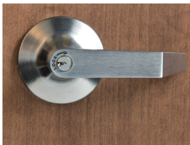
Arrows show direction to turn the key on cylindrical locks (Classroom Security Intruder function)

As each school makes its determination about what classroom security means, you can rest assured that ACCENTRA™ has at least one solution to get the job done. Many ACCENTRA products were developed specifically for school settings and provide unique functionality to keep students and staff safe and mobile.