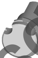
Figure 2: All (except Primus)