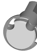
Figure 3: Primus only