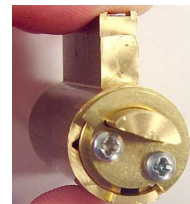
Cylinder Back with Driver