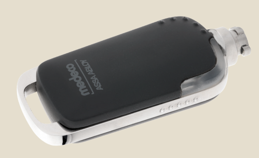
XT Slim Line Key