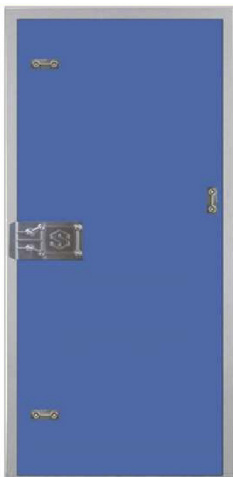
Standard Anti-Pry Plate