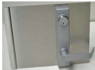
TEL-KLT-AP TEL-KDT-AP TEL-KRT-AP TEL-KLST TEL-KDST