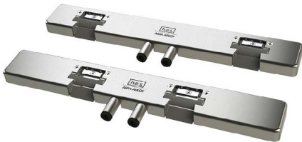
Double Electric (ESK-9200) Storefront, Metal, Wood, and Glass