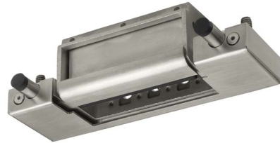
Single Electric (ESK-1600-SGL) Storefront, Metal, Wood, and Glass