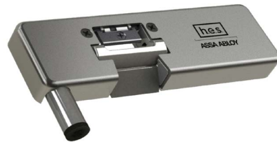
Single Electric (ESK-9100) Storefront, Metal, Wood, and Glass