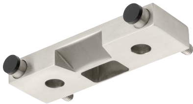
Single Manual (MSK-SGL) Storefront, Metal, Wood, and Glass Backset: 2 1 / 4 " or 4 1 / 8 "