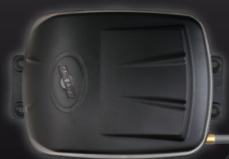
On-board air compressor

You don't need a bigger truck... You need Air Lift.