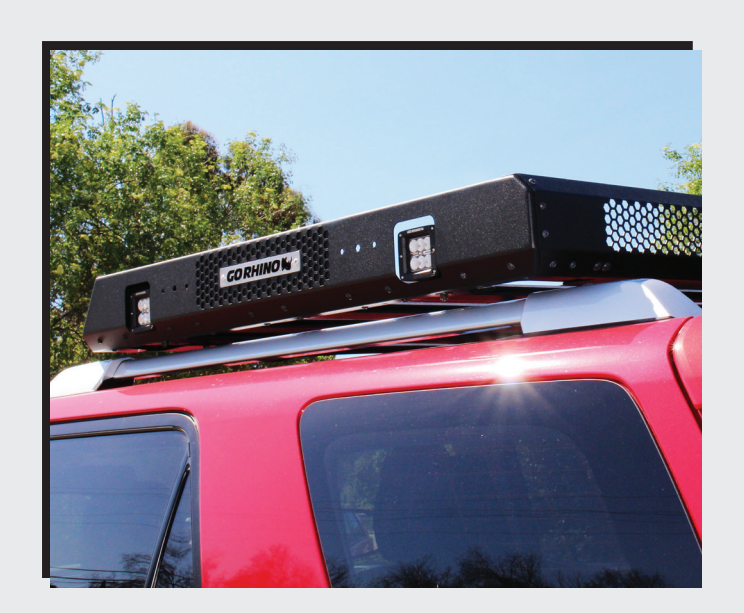
$50 eRewards SRM400 Roof Rack