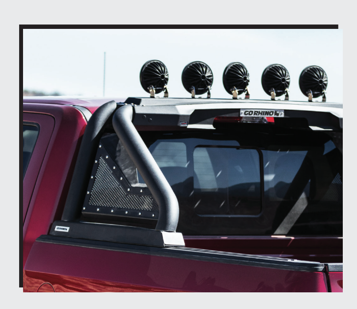
$100 eRewards Sport Bar 2.0