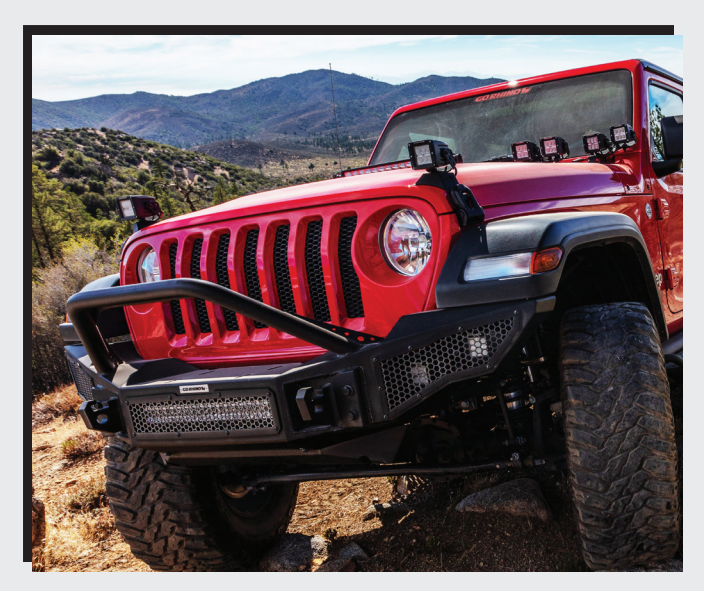
$50 eRewards Rockline Front Bumpers