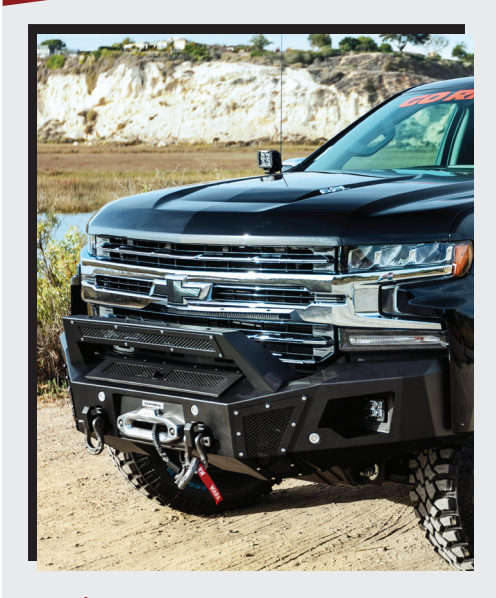
$100 eRewards BR Series Truck Front Bumpers