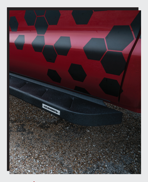
$50 eRewards RB10 Running Boards