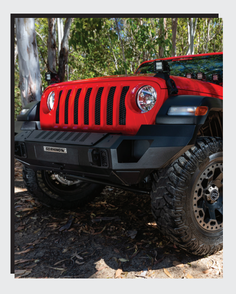
$50 eRewards Trailline Jeep® Bumpers