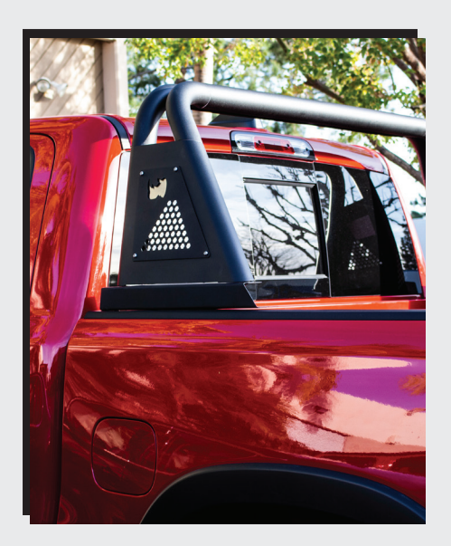
$35 eRewards Sport Bar 3.0