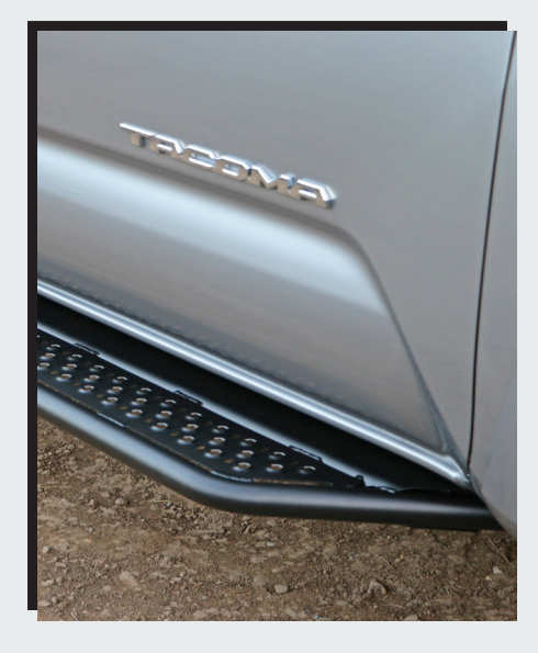
$50 eRewards Dominator D6 Side Steps