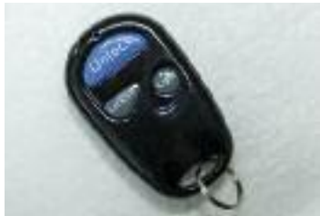
Keyless Remote – Uses Truck's Fob