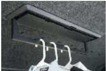
Fold-down Clothes Hanger