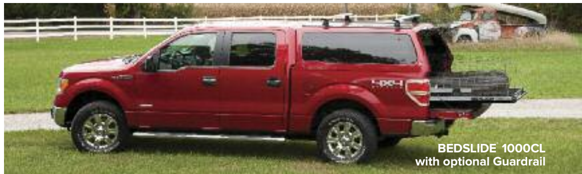
BEDSLIDE® 1000CL with optional Guardrail

BEDSLIDE® is the ultimate LEER Cap and Tonneau accessory for heavy-duty work or serious play. LEER with the BEDSLIDE® option turns your truck bed into an easy access, sliding drawer, making loading and unloading cargo simple, safe and secure.