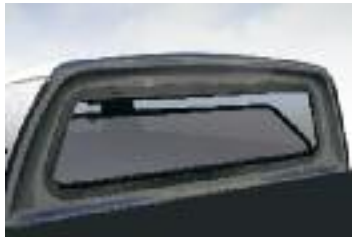
Removable Front Picture Window