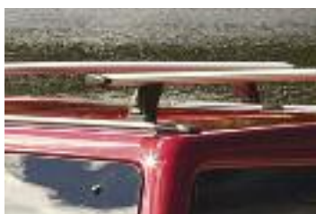
Thule® AeroBlade with Push-button Locks (Choice of Brushed or Black Finish)