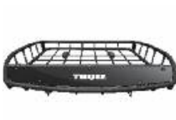
Thule® Canyon Cargo Basket