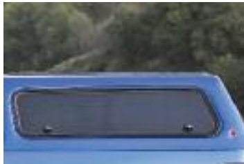
Radius Side Window