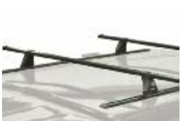
Thule® Tracker II with Push-button Locks