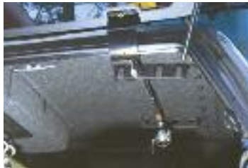
Fishing Rod Holder