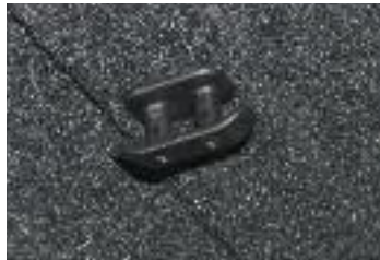
Cargo Hooks - 4 or 8