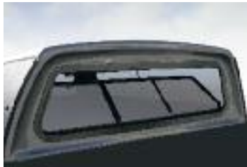
Removable Front Slider