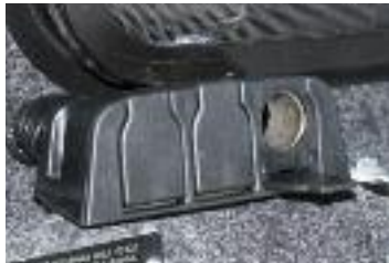
3-Outlet 12V Powerblock