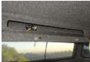
Locking Overhead Storage Box