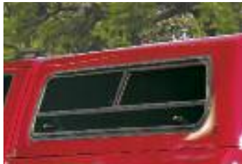
Side Window Slider