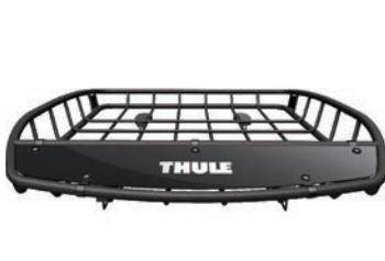
Thule® Canyon Cargo Basket