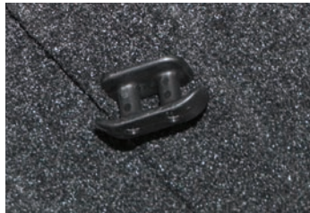
Cargo Hooks - 4 or 8