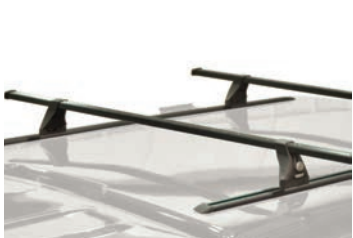
Thule® Tracker II with Push-button Locks