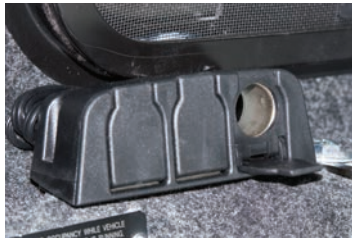
3-Outlet 12V Powerblock