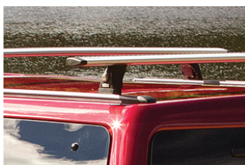
Thule® AeroBlade with Push-button Locks (Choice of Brushed or Black Finish)