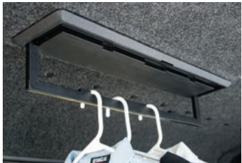
Fold-down Clothes Hanger