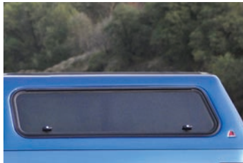
Radius Side Window