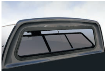
Removable Front Slider