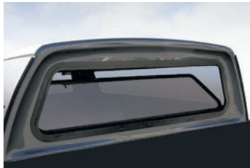
Removable Front Picture Window