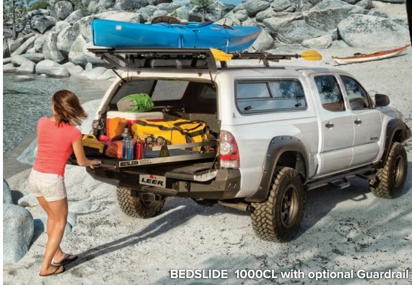
BEDSLIDE 1000CL with optional Guardrail