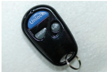
Keyless Remote – Uses Truck's Fob