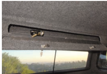
Locking Overhead Storage Box