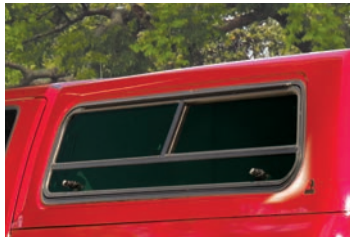
Side Window Slider