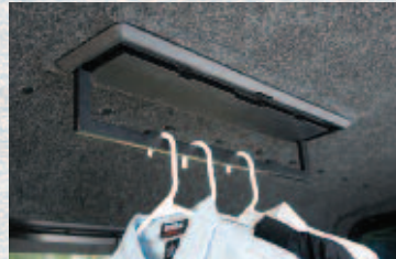
Fold-down Clothes Hanger