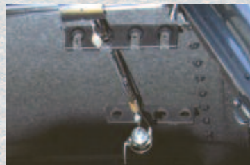
Fishing Rod Holder