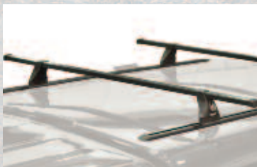
Thule® Tracker II Roof Rack with Locks