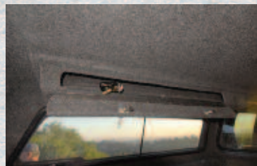
Locking Overhead Storage Box