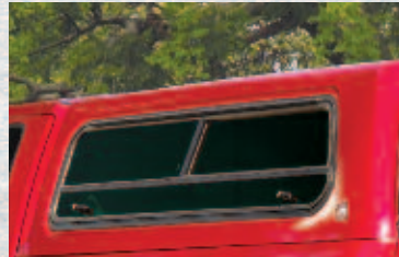
Side Window Slider