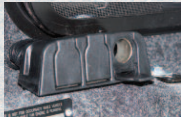
3-Outlet 12V Powerblock