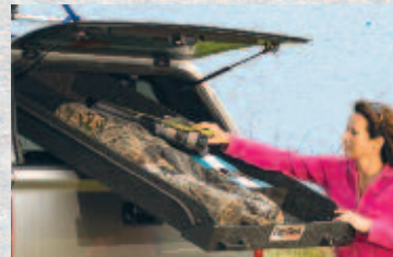
CENTURY Cap-Pack Sport