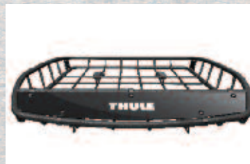
Thule® Canyon Cargo Basket