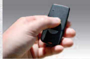
Keyless Remote – Select Models