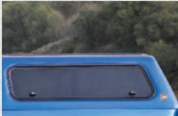
Radius Side Window