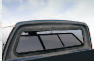
Removable Front Slider